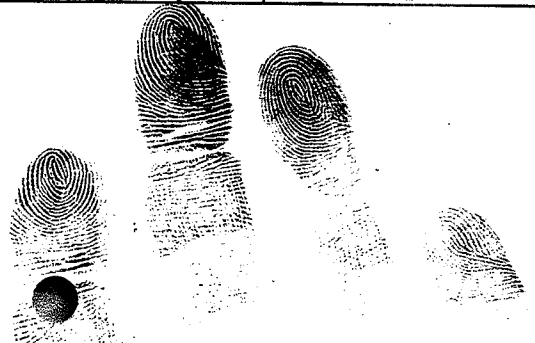
RIGHT FOUR FINGERS TAKEN SIMULTANEOUSLY