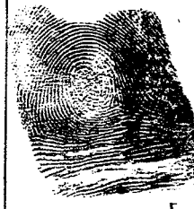
4. R. RING