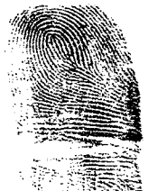
5. R. LITTLE