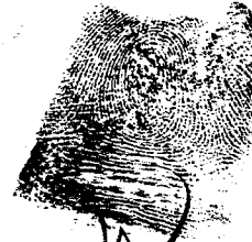
9. L. RING