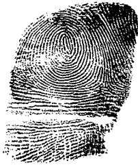
2. R. INDEX