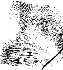
8. L. MIDDLE