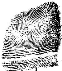
2. R. INDEX