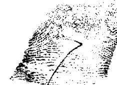
10. L. LITTLE