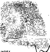
7. L. INDEX