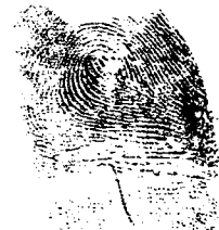
5. R. LITTLE