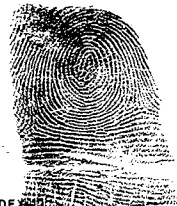
7. L. INDEX