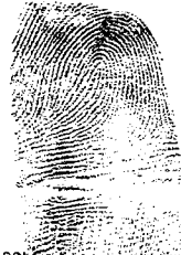
8. L. MIDDLE