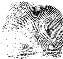
6. L. THUMB