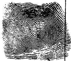
1. R. THUMB