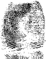
10. L. LITTLE