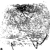
6. L. THUMB