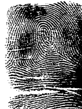
4. R. RING