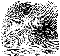
1. R. THUMB