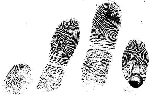
LEFT FOUR FINGERS TAKEN SIMULTANEOUSLY