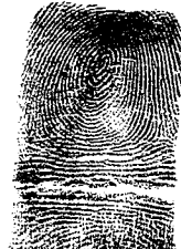
9. L. RING